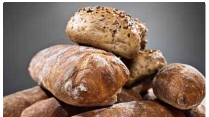
6. The Rotosole masters any artisan bread to perfection. It increases your output while saving energy, handling, waste, and staff. And leads to better total cost of ownership.