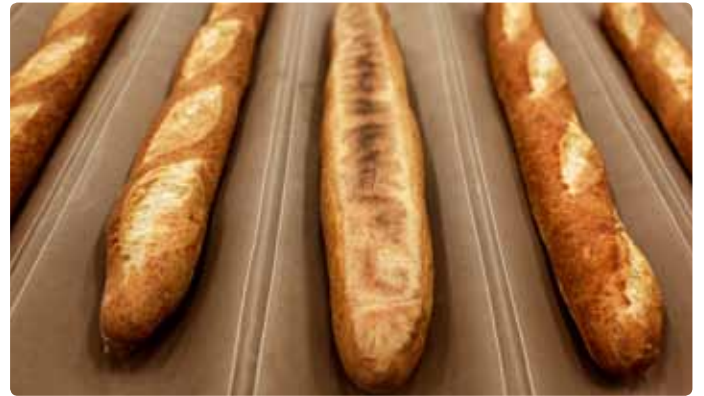
5. And voila, the artisan bread comes back out as perfect baguettes, ciabattas, rolls or whatever you put in there.