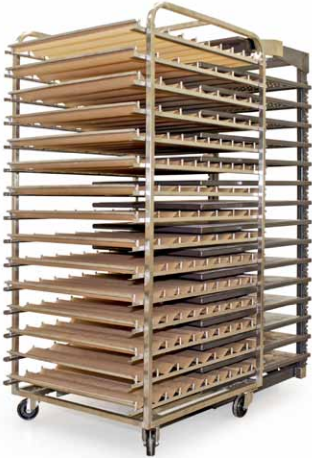
1. With the Revent Rotosole, you simply convert your rack over into a deck oven with the qualitative advantages of baking on a hot sole.