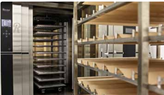
3. The Rotosole unit is stationed and pre-heated in the oven. All you need to do is enter the Rotosole racks with the soft trays and close the door.