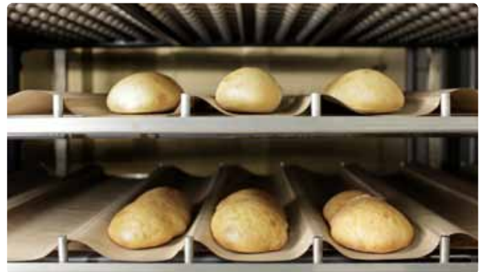
4. The Rotosole unit is elevated – bringing the bread in contact with its hot aluminum surface.