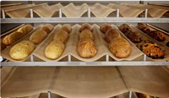
2. You can load the Rotosole with different trays to suit your needs.